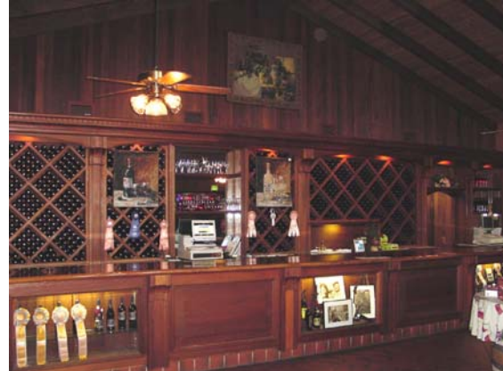
(Left) Ledgewood Creek Winery ~ (Right) Wooden Valley Winery