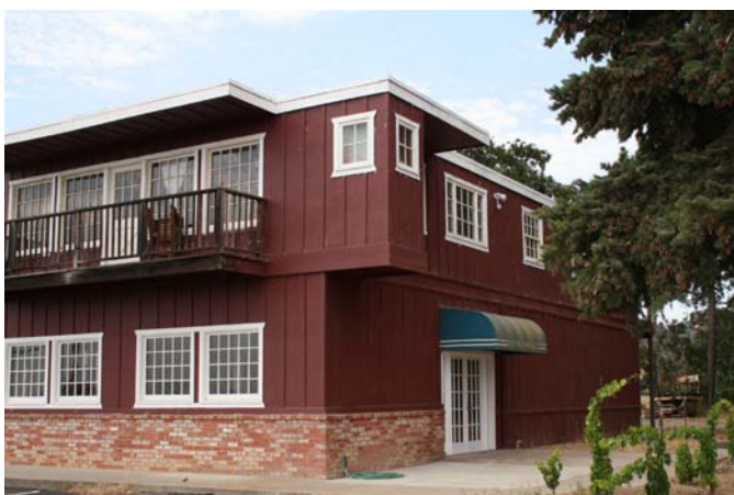
(Left) New cohesive sign program in progress ~ (Right) Suisun Valley Wine Cooperative

As Suisun Valley growers and producers begin to focus on what the association will be doing in the upcoming year to celebrate, they can't help but reflect back on what's happened within the last five, once they decided to drive their message forward.